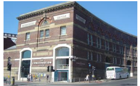
The National Conservation Centre

National Museums Liverpool's key objective was to introduce an energy management scheme that would enable them to monitor and ultimately micro - manage the energy consumption across the site. This could be achieved by the automated collection of half hourly data which could then be processed in order to identify erroneous consumption profiles and areas of potential energy wastage. Minimal disruption to the museum, was important given that the work needed to be carried out during opening hours.