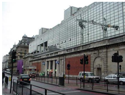
Victoria Plaza 111 Buckingham Palace Rd